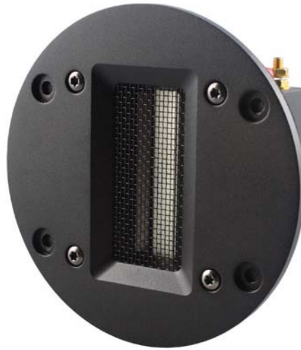
NeoCD3.0 True Ribbon Tweeter