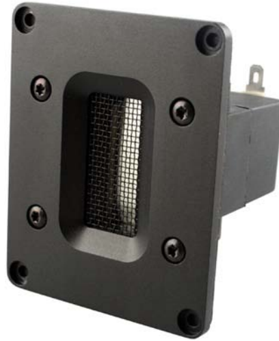
NeoCD1.0 true ribbon tweeter